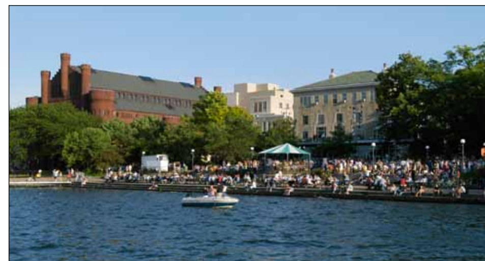
Memorial Union Terrace

See www.dcs.wisc.edu/lisa/music/nsw.htm for updated general information.